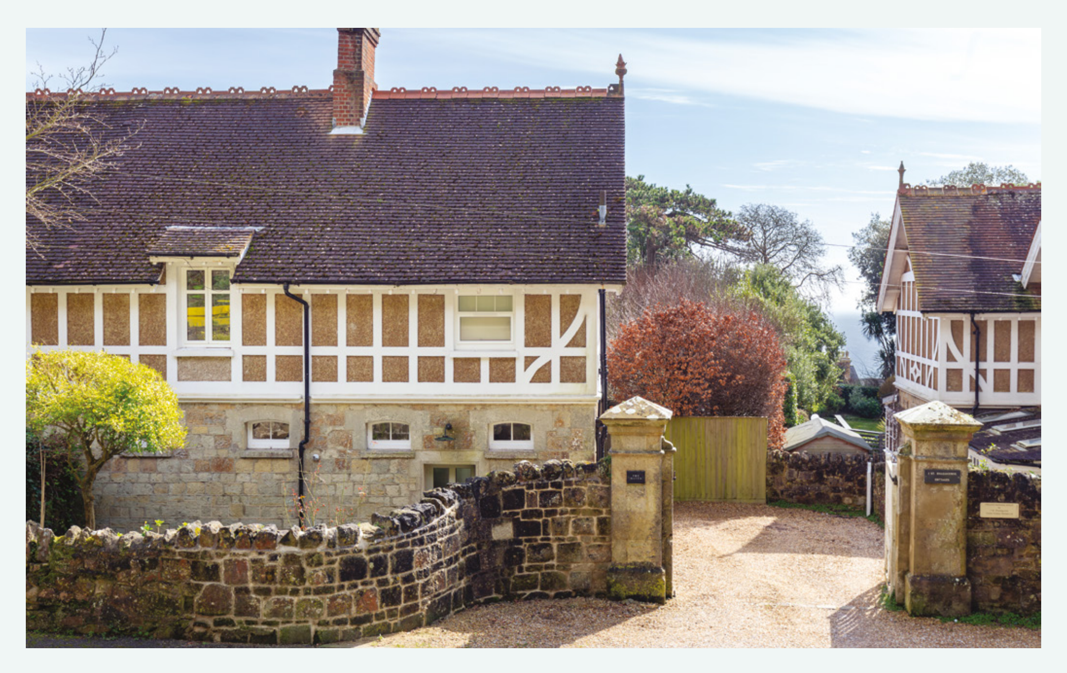
The Haven, Seven Sisters Road, St Lawrence, Isle of Wight